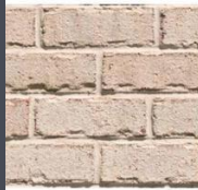
– Triangle Brick – Fear with Ivory Buff mortar