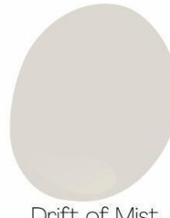
Drift of Mist Sherwin Williams