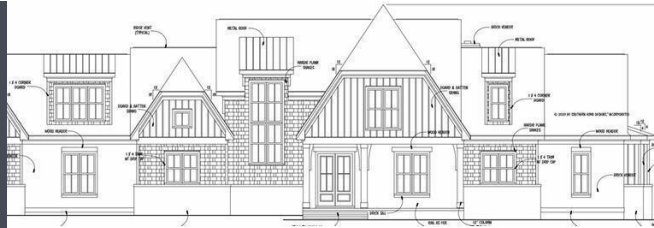
– Bronze exterior, bronze interior