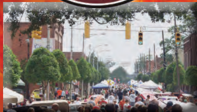
The Harvest Festival

Business Week Magazine ranked Clayton in the Top 10 of the Country's Most Affordable Places to Live and Assure a Top Education for Your Children.