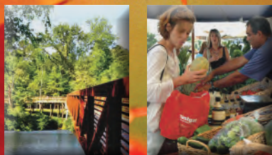
River Walk Farmer's Mkt.