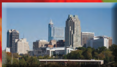
Easy Commute to Downtown Raleigh