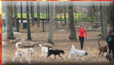
East Clayton Dog Park