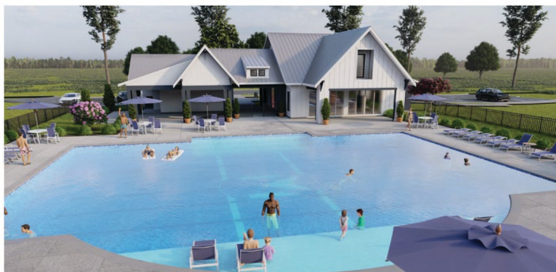
6-LANE SWIMMING POOL