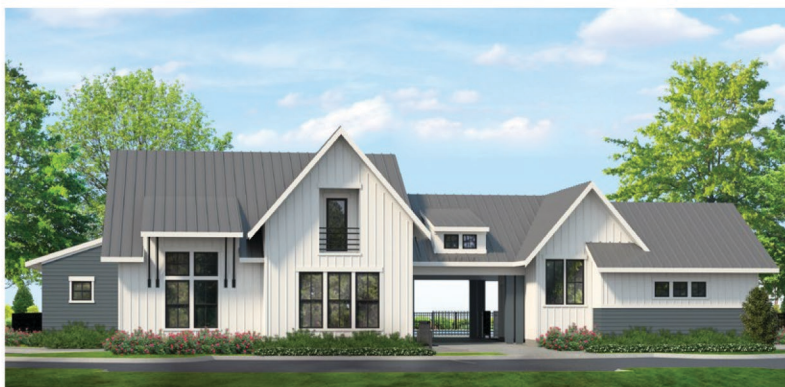
MASON HALL – COMMUNITY CLUBHOUSE

East & Mason is excited to deliver homes and amenities that offer work-from-home opportunities, integrate indoor and outdoor living, and accommodate multi-generational living. Our vision is to bring people together by creating a unique sense of place in a walkable coastal community. Mason Hall, our community clubhouse includes a large event room and warming kitchen, flexible meeting & activity rooms, and a six-lane swimming pool.