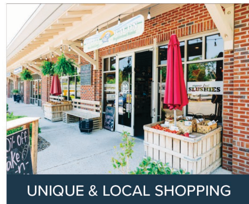
UNIQUE & LOCAL SHOPPING

Masonboro Elementary School is right across the street, soon to be linked to East & Mason by a new 1.4-mile pedestrian and bike path.