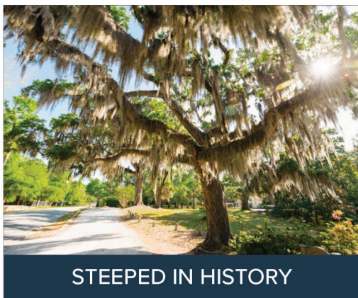
STEEPED IN HISTORY

East & Mason offers convenient access to top schools, shopping, natural amenities, and outdoor recreation.