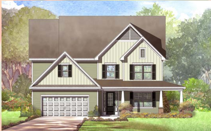
Elevation A - Front Load Garage