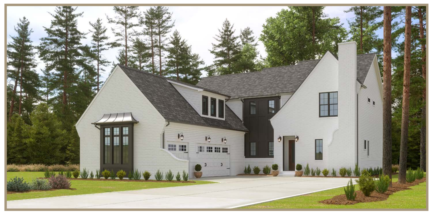
Country Chic (rendering displays optional 3rd car extension)