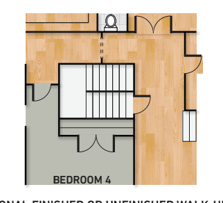
OPTIONAL FINISHED OR UNFINISHED WALK-UP