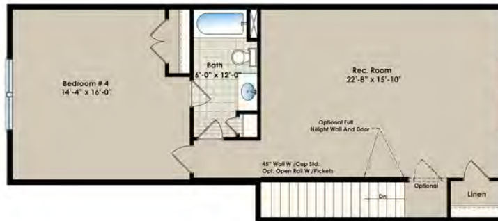
Bedroom # 4 Option (+395 Sqft)