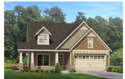
Single Door Garage